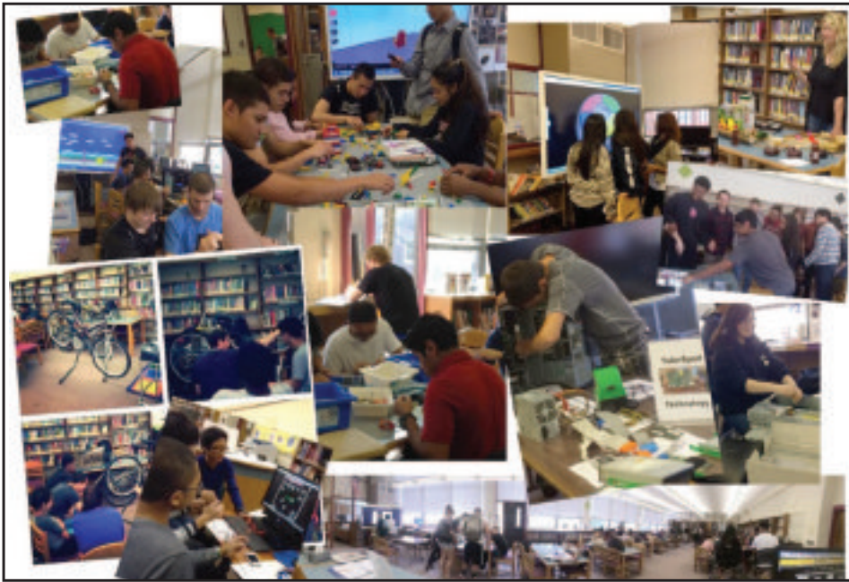
Figure 2. Glimpses into the makerspace at NMHS, a "thriving learning metropolis."

Winterberg, Jenna. Watch Me Draw Dolphins, Whales, Fish & More. (Watch Me Draw). Walter Foster Publishing, 2015. 24p. LB $17.95. 9781939581341. Grades K-2. Combining a drawing and story book, the bright illustrations encourage even young readers to follow directions to create the simple characters.