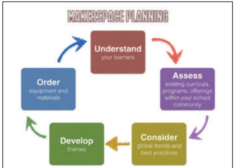
Figure 3. The NMHS process for planning the makerspace.

World War I (1914-1919). (Defining Documents in American History). Michael Shally-Jensen, ed. Salem Press, 2014. 308p. LB $175. 9781619254916. Grades 9-12. This academic title provides an in-depth examination into the causes, issues and long-term effects of the war through the writings of experts in the field. Included are primary sources of journals, legislation, and speeches of the time. Each section includes a bibliography and additional reading. A chronological list, Internet resources, general bibliography, and detailed timeline complete the volume.